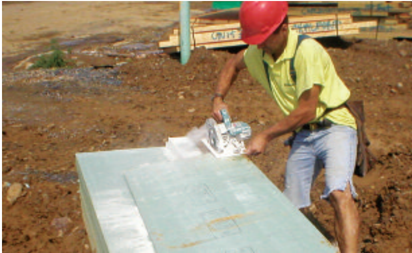
Gypsum board area separation wall liner panels can easily be trimmed with a power saw or knife to meet any size requirement.

L-shaped aluminum clips attach the gypsum board area separation wall to the adjacent wood frame structure. The clips attach to both sides of each H-stud at each floor or roof/ceiling intersection to provide lateral support for the area separation wall. The clips are designed to soften and break when exposed to high temperatures on the fire side.