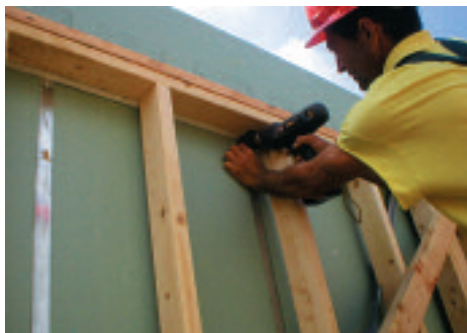
A construction worker attaches an aluminum clip that connects the area separation wall to the adjacent wood frame structure.

For two-hour fire resistance, the area separation wall